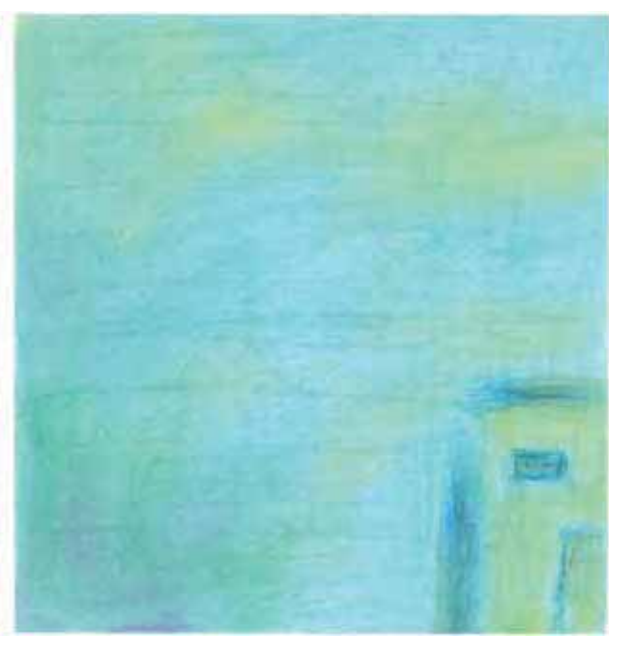
Illustration Masatoshi Tsutsui, Tsumiki Kobo