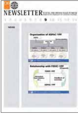
FIDIC-YPF News Letter Introduces ASPAC-YPF